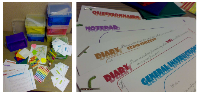
Figure 2. Probe sets (left) and individual probes (right).

Reflection started with an introductory explanation and the handing over of a set of cultural probes [9]. The probes (see Fig. 2) were intended to inspire participants when composing their time capsules [10]. They were designed specifically to provoke reflection about participants' past - what they might like to remember from 25 years ago - as well as the future - what they might want their grandchildren to know 25 years from now.