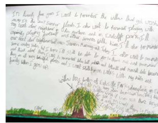
“This is something I wrote about the willow tree that got pulled out of its roots in the flood in the park last year [2007]. Mum and I really really liked it. Now that side of the river looks really plain without it.”

Essays : Writing of different sorts was classified as essays, 10%. Examples are: “a couple of short stories I’ve been writing [...] It was the deep of winter when, you know, you are looking for something constructive to do. It was a big thing during the year”; “I [aged 14] printed off computer screenshots of MSN [chats]. Just thought it’s gonna be nice [to see] what I talked about to my friends”. Schoolbooks and various children’s writings were included in this category. Sometimes the writing was purposefully done to capture today’s memories and feelings (see Fig. 3).