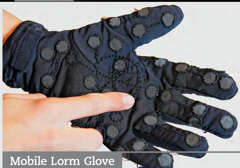
Mobile Lorm Glove

The airpiano is a MIDI/OSC controller that lets the user trigger invisible keys and faders in midair. The device can be used for playing melodies, triggering loops, and controlling effects. On-board LED feedback allows performing without the need for a computer display. Setting the 24 virtual keys and eight virtual faders is accomplished with custom software. The airpiano introduces not only an intuitive and simple touch-free interaction, but an entirely new user experience centered around exploring this experimental instrument.